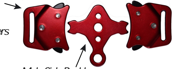
Male Side Buckle

Note: if your harness was upgraded with the light quick release buckles, make certain to verify the stamping on the buckles and find out if they are part of the above potentially problematic series