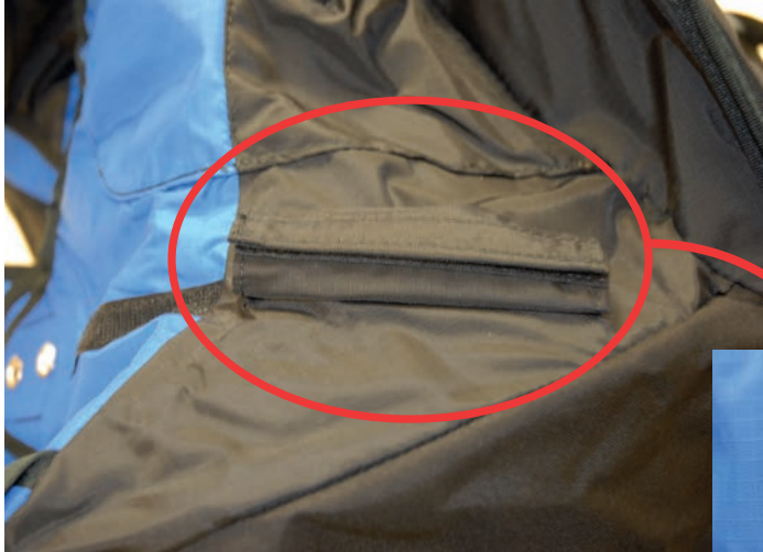
① Original handle housing arrangement

Open the handle housing : the Velcro is continuous. ②